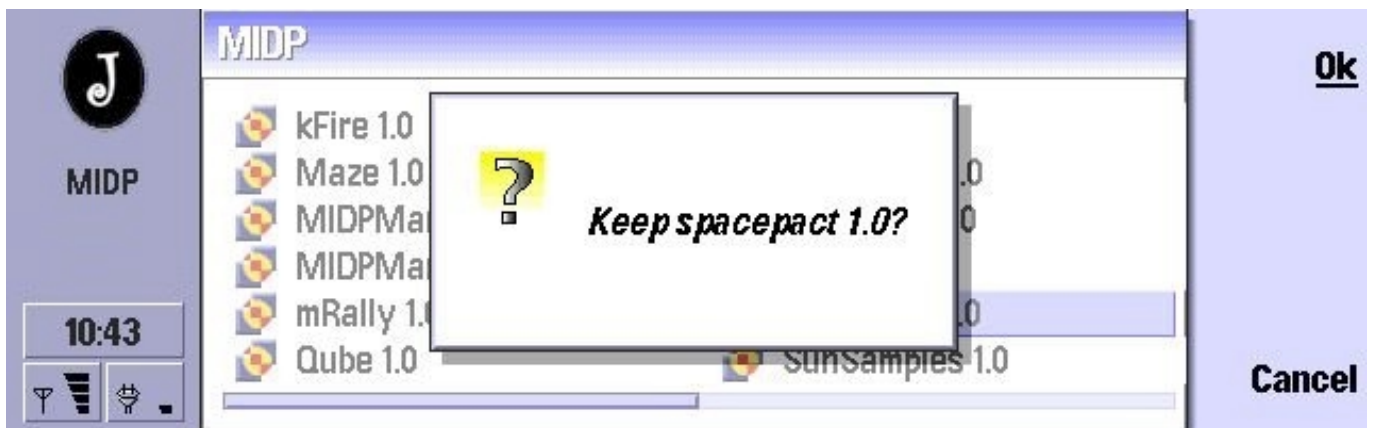
Picture 1. The dialog for keeping installed midlet in the MIDP Test Software Application List

The "MIDP Test Software" asks do you want to keep the MIDP-application (Picture 1.).